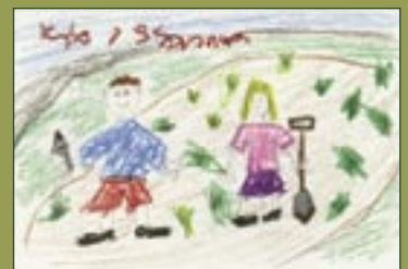
Rain Garden Drawings! Page 5