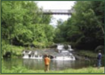
Cover Photo: Fishing on the South Fork of the Kinni at Glen Park