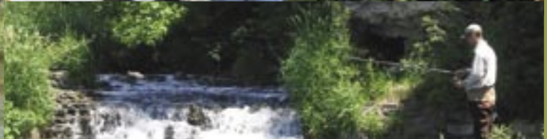
KinniFest featured many outdoor classrooms and fieldtrips.