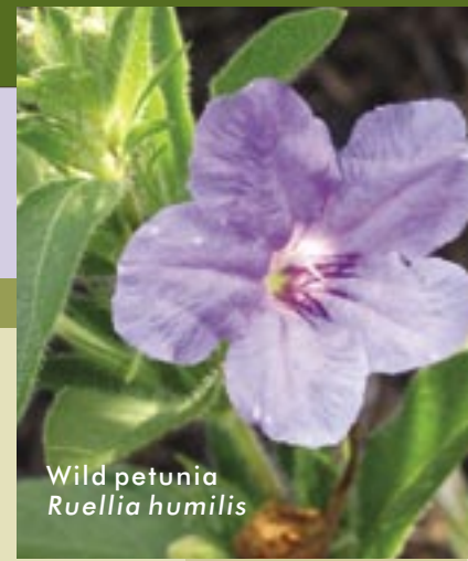
Wild petunia Ruellia humilis

We extend our grateful thanks to our 2006 January 1-June 30 volunteers and donors. We have tried to include all of our wonderful friends and regret omitting anyone's name. If we have done so, please call us at 715-425-5738.