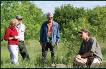
Field day participants learn about the forest floor.